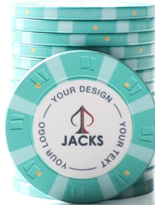
PREMIUM CERAMIC "CARDS" MOLD CHIP