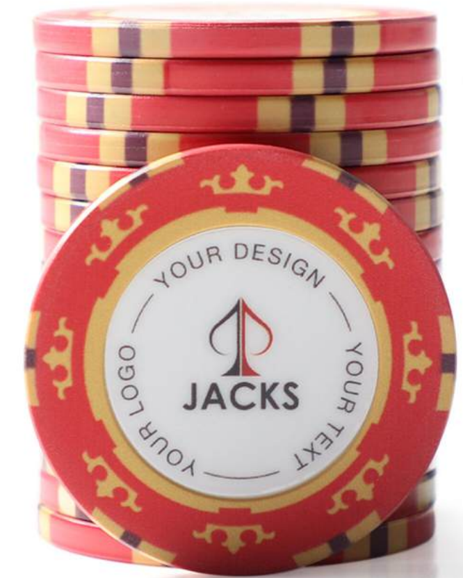
LUXURY HYBRID CERAMIC CHIP