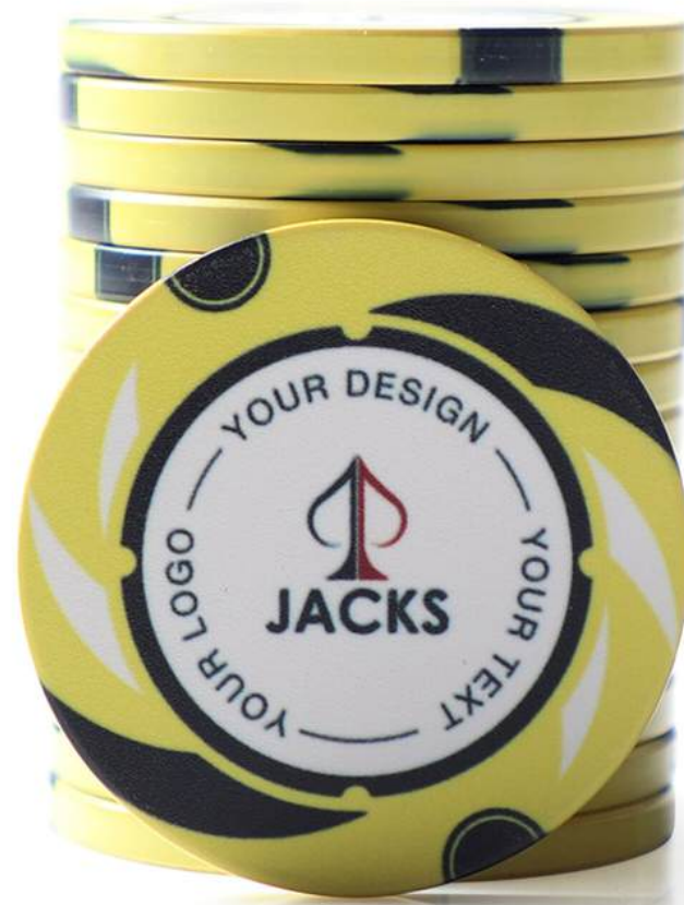
PREMIUM CERAMIC CHIP