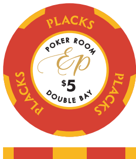
Colour Option 3