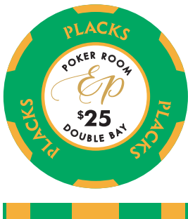
Colour Option 5