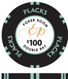
Colour Option 6