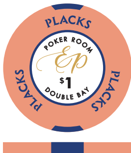
Colour Option 1