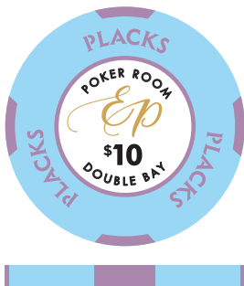
Colour Option 4